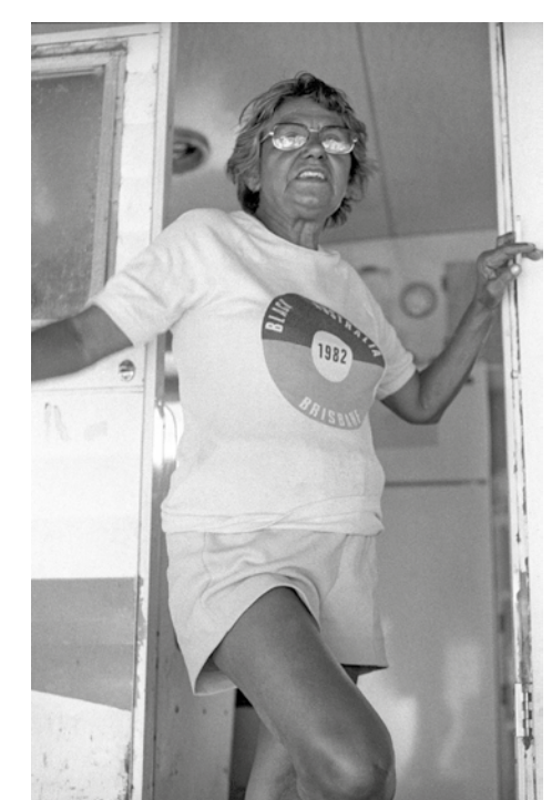
Oodgera Noonuccal at Moongalba 1982 by Juna Gomes (b. 1984) selenium toned, gelatin silver photograph Collection: National Portrait Gallery, Canberra Purchased 2004

ACHCK049 ACHCK052 ACHCK053 ACHCS060 ACHCK066